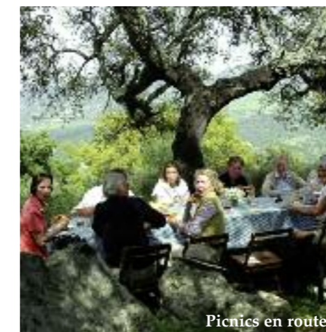
Picnics en route