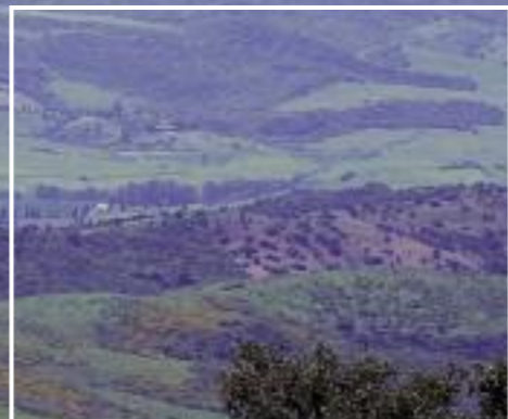
The view from the terrace stretching into Africa